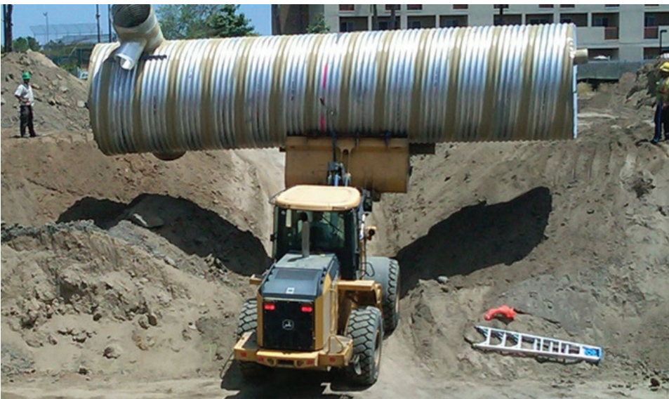
Los Angeles Conservation Corp constructing Compton Creek Natural Park

Existing traditional workforce development programs could be augmented to include this type of training and new training programs could be developed specifically to support river-focused job training. For example, the Los Angeles Trade-Technical College's workforce and economic development program could be utilized to build employment capacity to support revitalization projects. Connections could be made between existing workforce training programs and employment in work in complementary jobs associated with the project, i.e. food vending for events. Workforce training also can be integrated into community benefits agreements associated with revitalization projects in the LLAR.